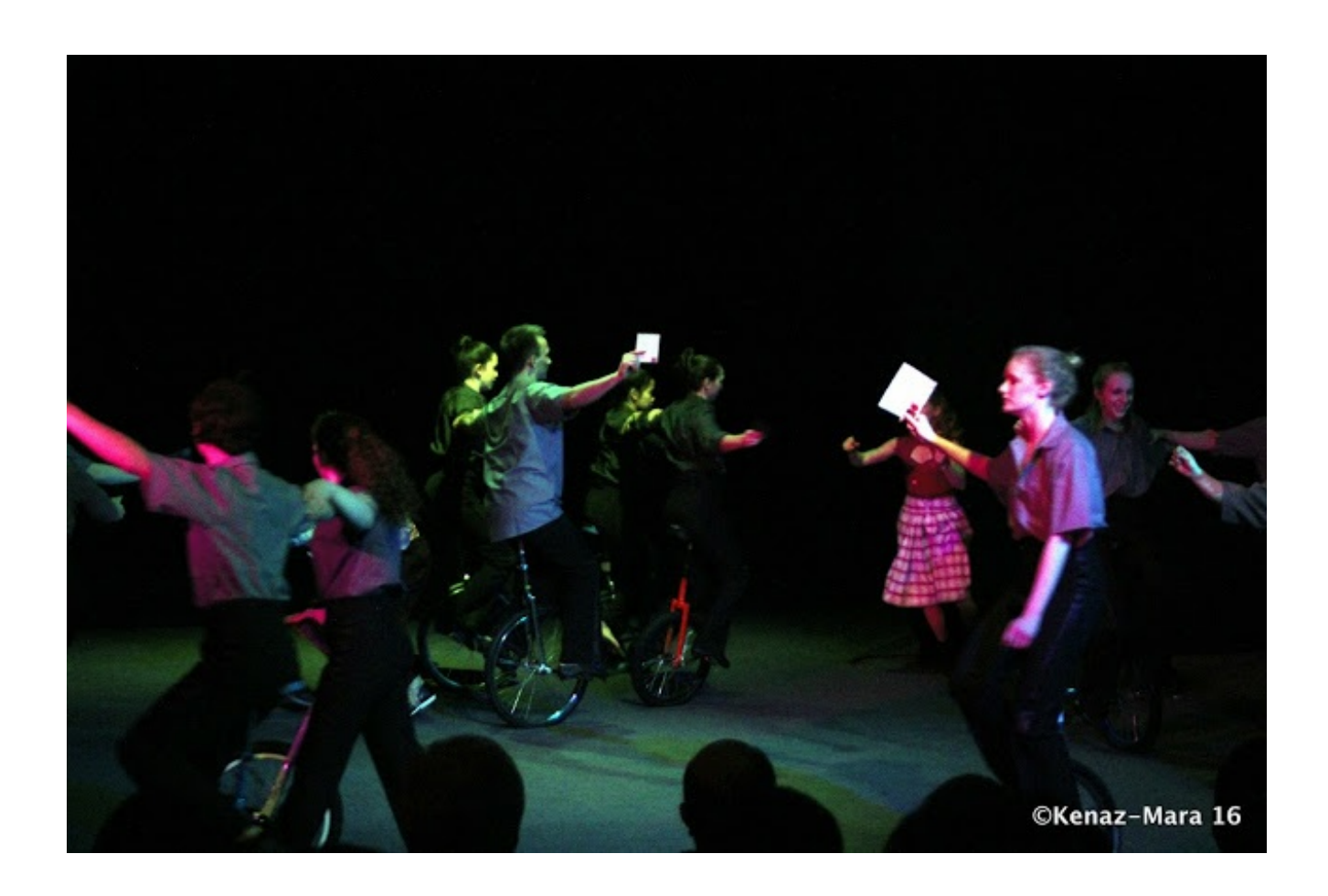
We also adored the scenes where Marnie & Phil interact with their young, young adult and elderly selves! They're a pure delight.