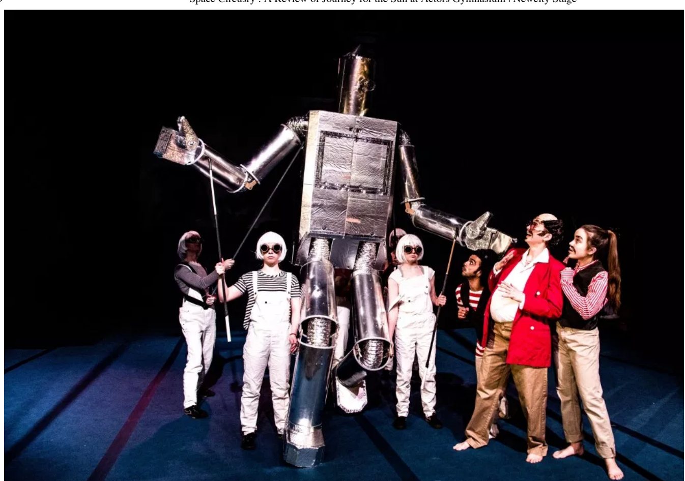
The cast of "Journey for the Sun"

"Journey for the Sun" is a weird and fun romp of a performance piece about a lonely drivein movie theater owner who goes into space to rescue the world from the burning sun. It features aliens, satellites and an enormous, remarkable robot puppet. Like all shows at the Actors Gymnasium, it invokes a sense of childlike wonder. It's hard not to feel joy when watching silks, juggling, tumbling and clownery.